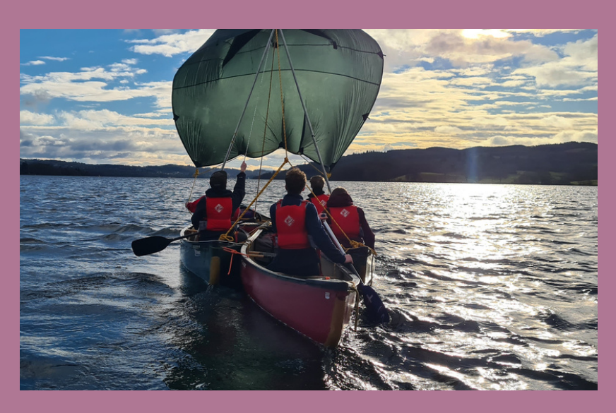
Outdoor students conducting a woodland vegetation survey (TL), Experiencing winter hill walking (TR), River Survey, Conservation Students (BL), 'Swallows & Amazons' (BR).