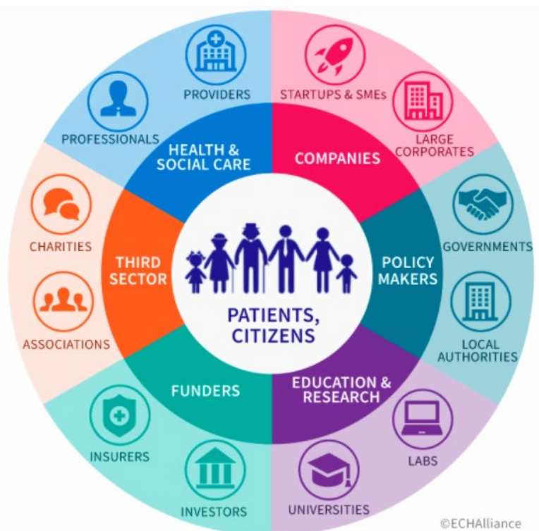
Figure 1. Example of a Health and Wellbeing Eco-system